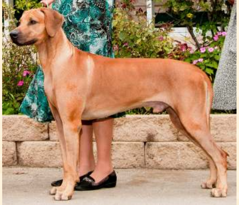
18-22 Month Junior Dog; 1st Place COPPER RIDGE ONE LUCKY LION

4th place - COPPER RIDGE ONE GOOD TIME CHARLIE - very smooth. Strong top-line. A nice example of light wheaten with dark eyes and black points. To fault this dog's color would be foolhardy. The only fault I could find is his size.