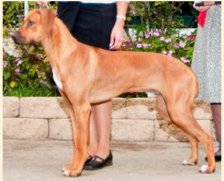
9-12 Month Puppy Dog; 1st Place JOLIBA'S CLASSIC BREW Breeders/Owners: Bing & Deborah Drastrup

4th place - DIABLO'S KONA FALLEN ANGEL - not dissimilar to my 2nd place dog but not as strong a topline on the stack and movement.