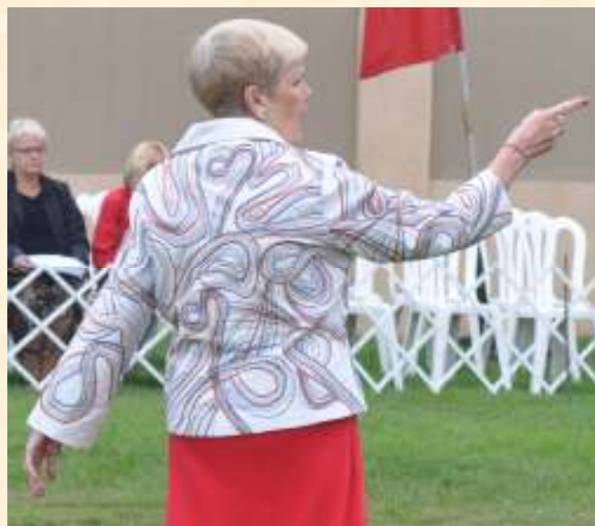
She's a woman who knows what she wants!

It's judging, so it's subjective. Spectators formulate opinions, but I'll guarantee those opinions could very well change when standing inside the ring doing the judging.